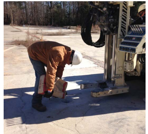
Zebra personnel grouting a borehole

As the probe travels through the soil it detects volatile compounds, measures soil electrical conductivity and injection pressure. Computer software estimates hydraulic conductivity and water table elevation, as well as prepares graphical outputs of the data.