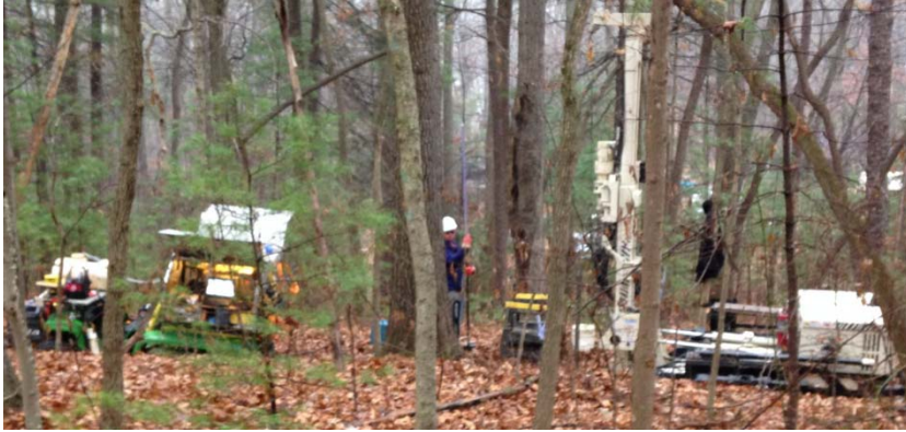
MiHpt boring location #50

Activities associated with the Non-Aqueous Phase Liquids (NAPL) Investigation began on September 23, 2013. The work includes a multi-step process to better understand how deep and wide the highest concentrated contamination exists on and adjacent to the former plant property. Zebra Environmental had a prior commitment for work on another project this week, but will resume work on property adjacent to the eastern boundary of the former CTS