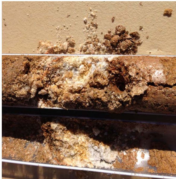
Soil from a bore hole in November 2013

After borings are completed, the holes are filled with bentonite grout.