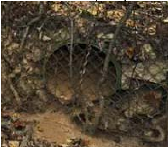
Empty barrel at the fence line near the back of the CTS Site

In the meantime, well water sampling and filtration system installation and maintenance will continue. The next quarterly well water sampling event is planned for the 2 nd week of January.