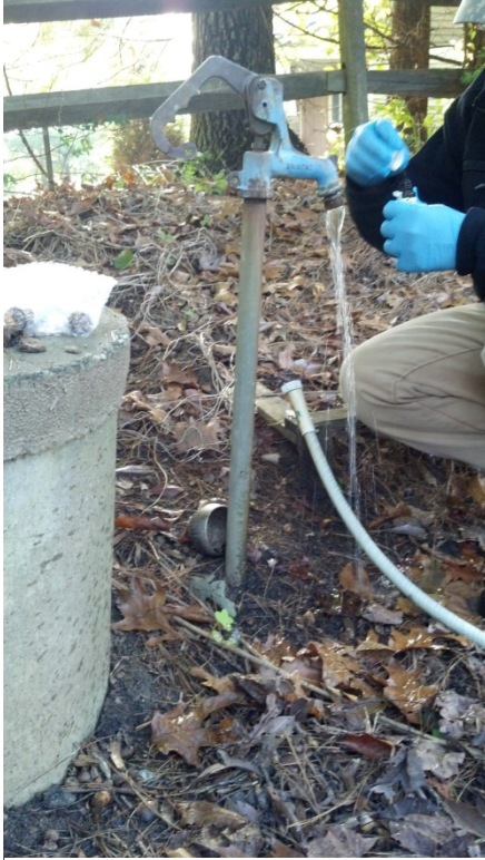
AMEC personnel collecting a water sample in October 2013

The fourth quarterly drinking water sampling event of 2013 was completed during the week of October 14 th . No VOCs have been detected during any of the quarterly sampling events of 2013.