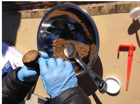
Soil sample being collected by AMEC for the SVE Confirmation Sampling Plan

In November, contractors completed collecting soil samples for the Soil Vapor Extraction (SVE) confirmation sampling plan. The purpose of that sampling event was to determine if any contamination remains in the soil in the area where the SVE system operated. The contractor sent the samples to a laboratory for analysis. The SVE system